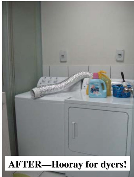
AFTER—Hooray for dyers!

ALWAYS GROWING THE TEAM A ministry support team has no limit. As the value of the dollar slides downward and ministries on the field grow, the needs of missionaries increase. If you like what you're hearing about our work here in Lima, and you feel that tug on your heart to get involved, please let us know. We can get you the information you need to get started. jgbrickey@gmail.com OR (803)223-9098 It's like calling us in the States!